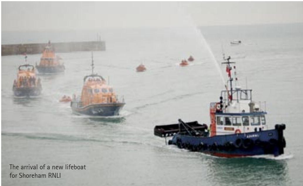
The arrival of a new lifeboat for Shoreham RNLi